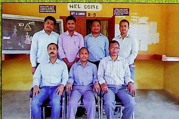
FACULTY MEMBERS OF COMMERCE