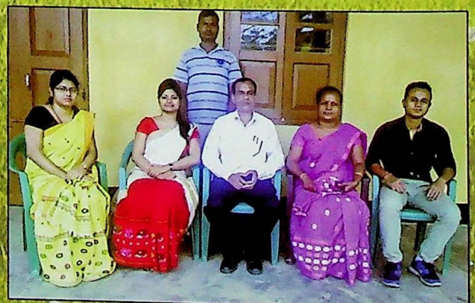
FACULTY MEMBERS OF SCIENCE & LABORATORY BEARER