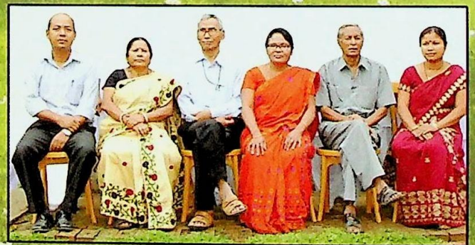
PRINCIPAL & PG FACULTY MEMBERS