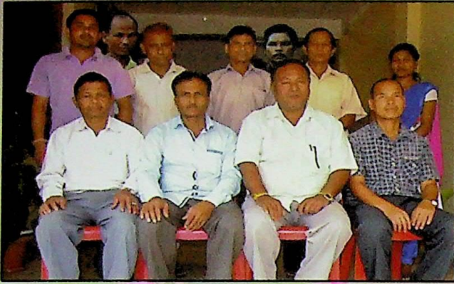
NON - TEACHING STAFF