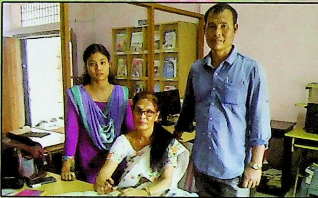
LIBRARIAN & STAFF