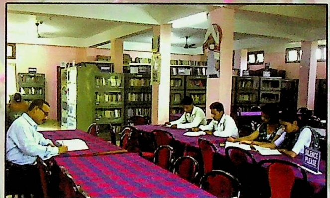
LIBRARY READING ROOM