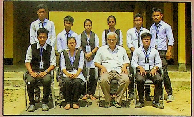
STUDENTS UNION'S PRESIDENT & MEMBERS