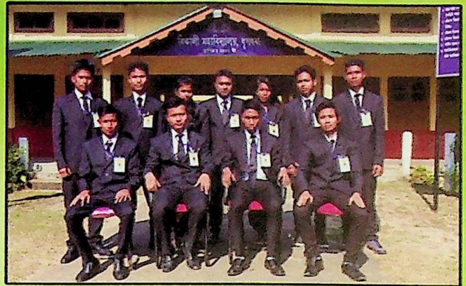
STUDENTS' UNION MEMBERS