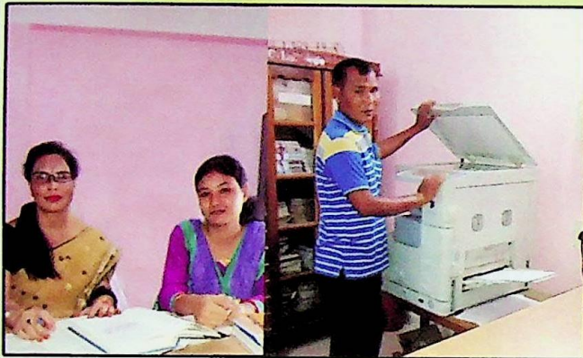
LIBRARIAN & STAFF