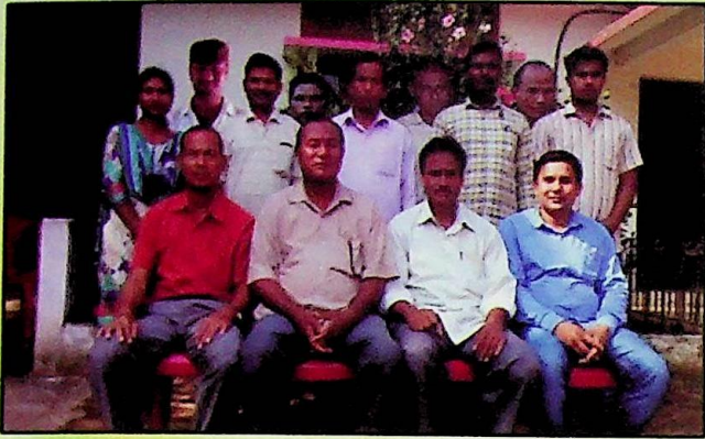
NON - TEACHING STAFF