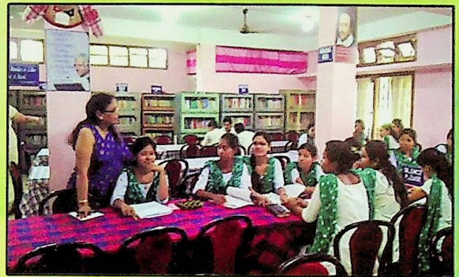
LIBRARY READING ROOM